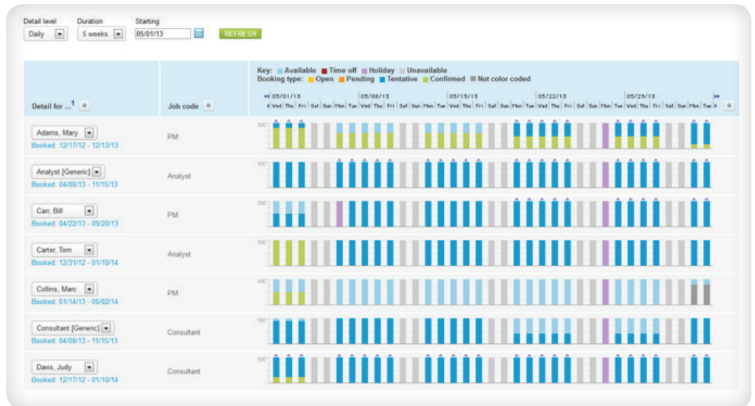
NetSuite OpenAir's graphical resource booking chart provides a graphical window into resource availability, location and more.